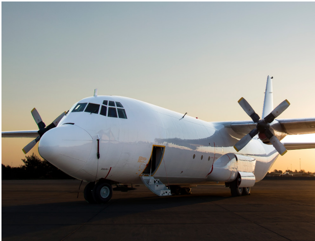
ZS-OPS, one of 6 Lockheed Hercules L100-30 aircraft owned and operated by Safair.

FlySafair is a part of Safair Operations, which will celebrate its 52nd Anniversary in August 2017. Safair has been one of Africa's foremost suppliers of specialised aviation services since inception in 1965. The business operates 6 Hercules L100-30 aircraft stationed in Northern Africa, predominantly involved in humanitarian aid and relief work. Safair has a Boeing division operating both Cargo and Passenger services. Presently there are 2 Boeing aircraft in this fleet.