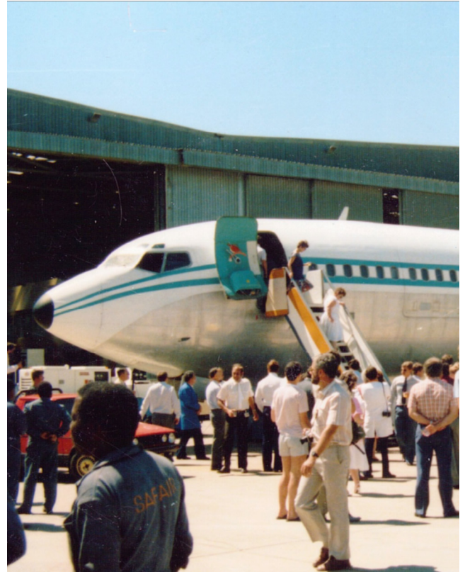
The arrival of Safair's first Boeing 707-300 on 5 November 1985.

It's the experience and expertise from this long-standing and highly respected company that has allowed FlySafair to establish such a large and efficiently run operation in such a short span of time. The airline presently boasts the best on-time performance of all carriers in South Africa.