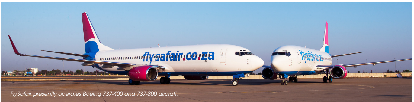
FlySafair presently operates Boeing 737-400 and 737-800 aircraft.

At present, in 2017, FlySafair was selected as the official domestic carrier for the Springbok Rugby Team. This sponsorship signifies a massive milestone for the airline, which has established itself as a major player in South African domestic aviation in just two years.